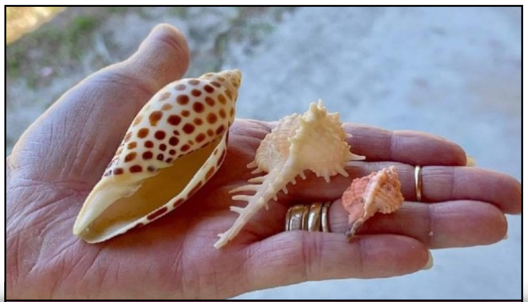
Colleen Fosnough had a sweet Valentine's Day on Shell Island!