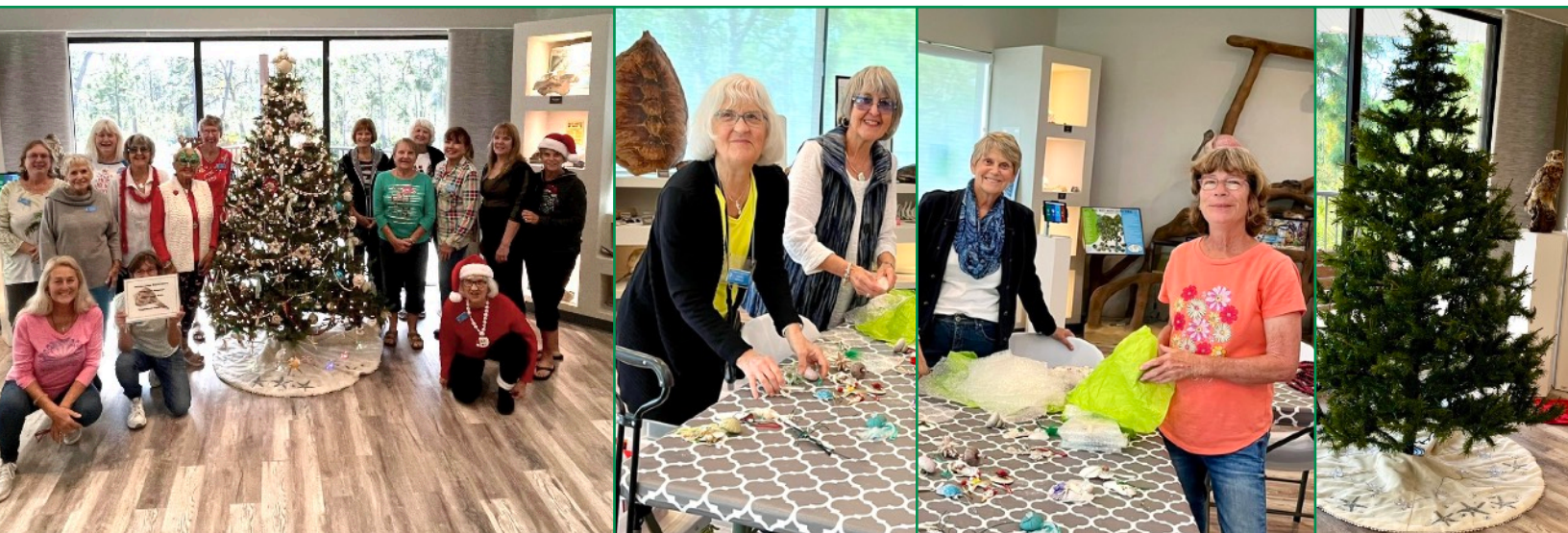
Left: The tree was assembled and decorated on Dec. 7. Middle-right: it was dismantled on January 17.