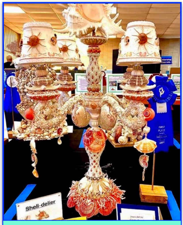
Sarasota Shell Show: ESC's Cindy Boyd, Blue ribbon winner